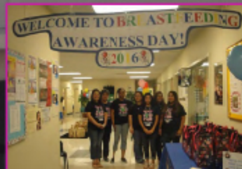
The VCPHD WIC Program proudly celebrated Breastfeeding Awareness Day.