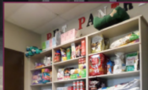
Victoria County Animal Control started a Pet Pantry program this year.