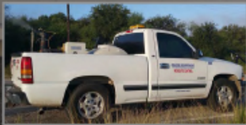
VCPHD Environmental Services sprayed and larvicided for mosquitos throughout the Spring, Summer, and Fall to prevent diseases like West Nile Virus and Zika.