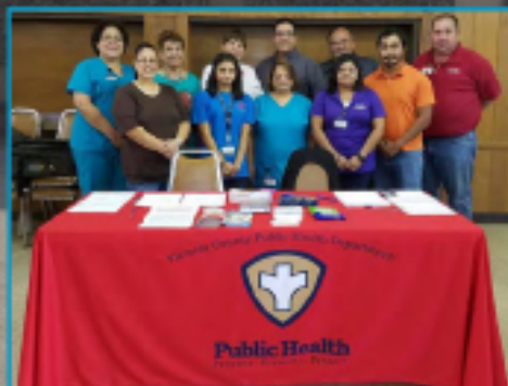
VCPHD held a health outreach fair in Bloomington with representatives from all areas of the health department.