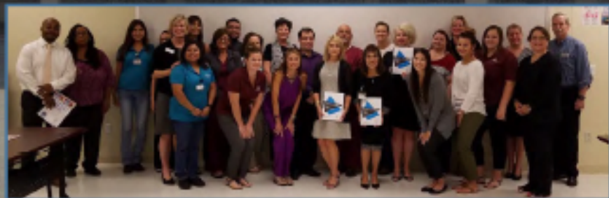
The Victoria County Active Living Plan was unveiled at VCPHD.