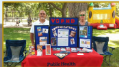
VCPHD Public Health Nursing held an immunizations fair at Riverside Park.